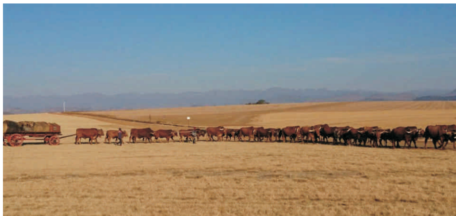
A full team of 36 inspanned for training

One of the major Stars of Sandstone 2019 will be our team of Afrikaner oxen and the work that they are trained to do.