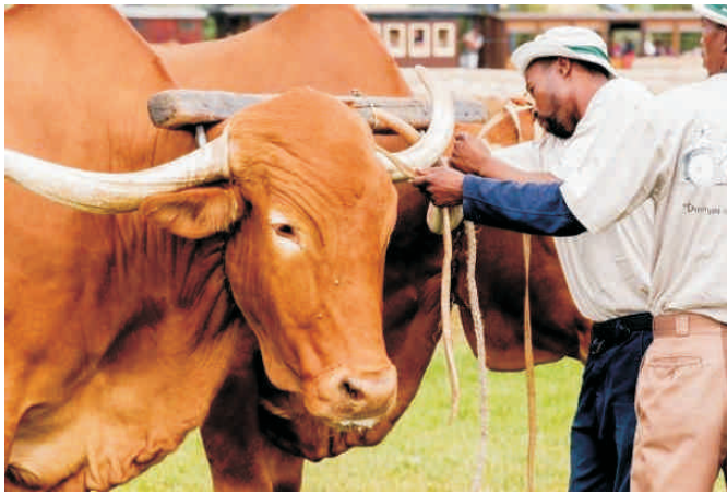
Attention to detail by the minders