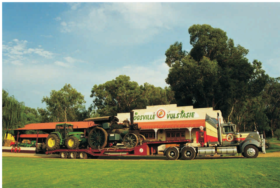
Over the years our Kenworth T900 has saved old Steam Traction Engines from many parts of South Africa