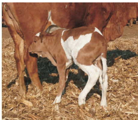
Calf born Tuesday, 18 Sept 2018