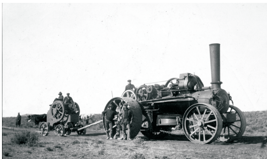
The arrival of the stone crusher from Britstown station towed by the "Right Hand" Fowler Z7 ploughing engine. Henry Vermaak is the driver. The crushing capacity was 1 cu yard per hour and this crusher was kept in service at the Syndicate until it was sold at the dispersal sale in October 1954. Photo taken in 1910

We have had a good response to our request for assistance from Traction Engine, Steam Roller and Road Locomotive drivers. These are the big heavy Traction Engines and other Road Steam vehicles in our collection.