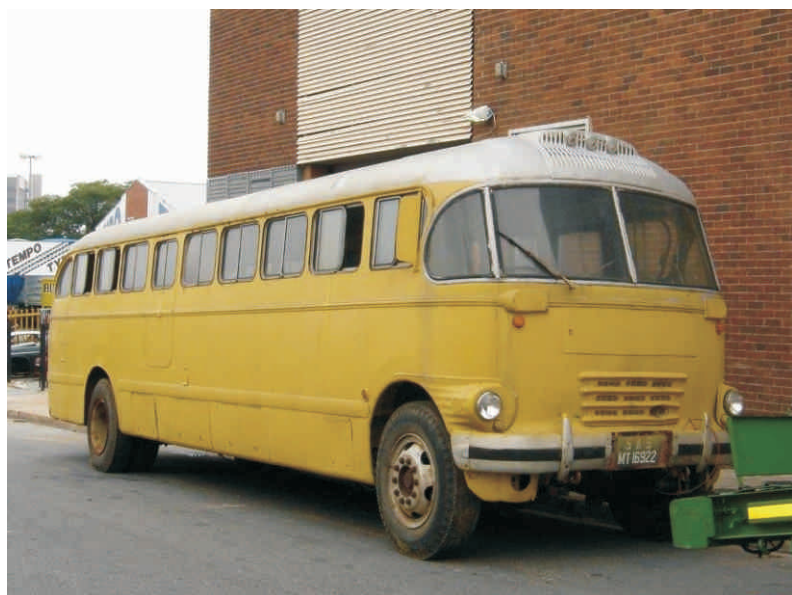
Sandstone's Brill, complete with its "SAS-MT" number plates