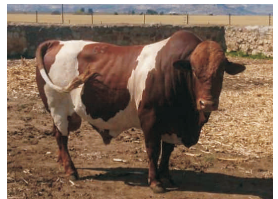
Newly purchased Bont Afrikaner bull, Thabo (happiness) from whom we have high expectations