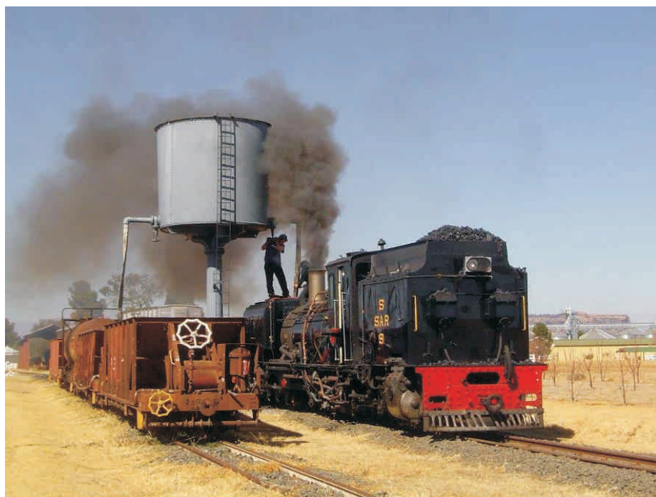
Typical scene on a Sandstone Steam Weekend! Class NGG16 No 113 takes water in Hoekfontein Yard prior to working a special train to Vailima NEXT STEAM WEEKENDS - Saturday, 22 September 2018 and also 16 and 17 November 2018 (Cherry Festival time)