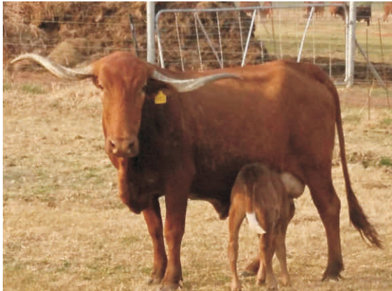
A classic Afrikaner cow with her trademark calf with its white tipped tail. This is a legacy from days long ago when the Afrikaner cattle were multicoloured, typically brown and white.