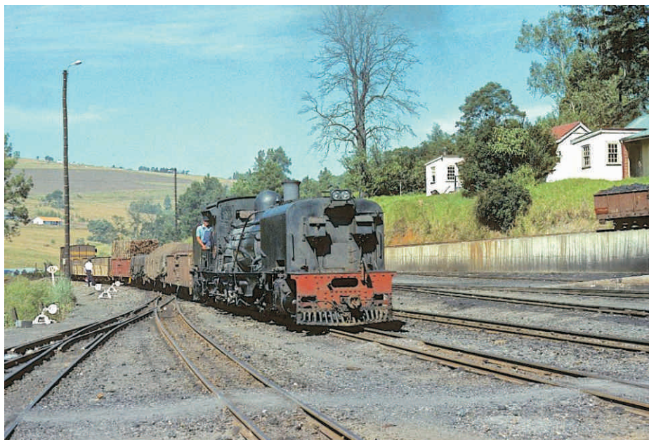
All traces of the Ixopo Station have now virtually disappeared.