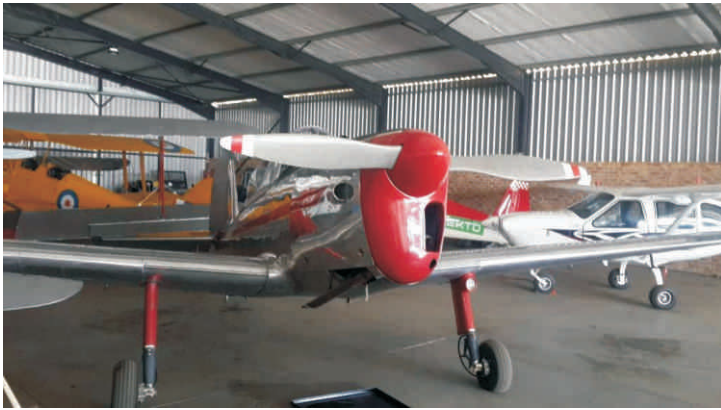
DHC 1 Chipmunk ZS-LJU, from the Classic Flying Collection, stabled with a horizontal propeller

Below: More Chipmunks, photo by Rod Smith