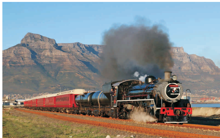
Ceres Rail's 19D 3322 departing Cape Town with the famous Table Mountain as a backdrop

For further details, price and bookings please contact us Mondays to Fridays: 09h00 to 15h00 on: T: 079 077 5332 (Overseas +27 79 077 5332) or bookings@ceresrail.co.za