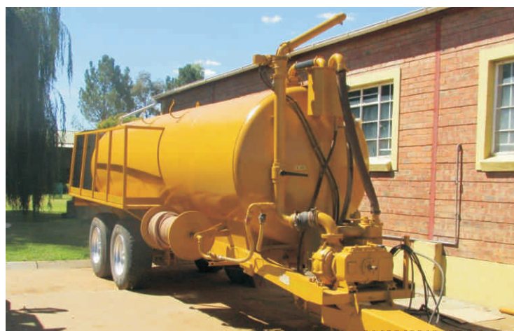
A fire-fighting tanker, often seen around the Estate.