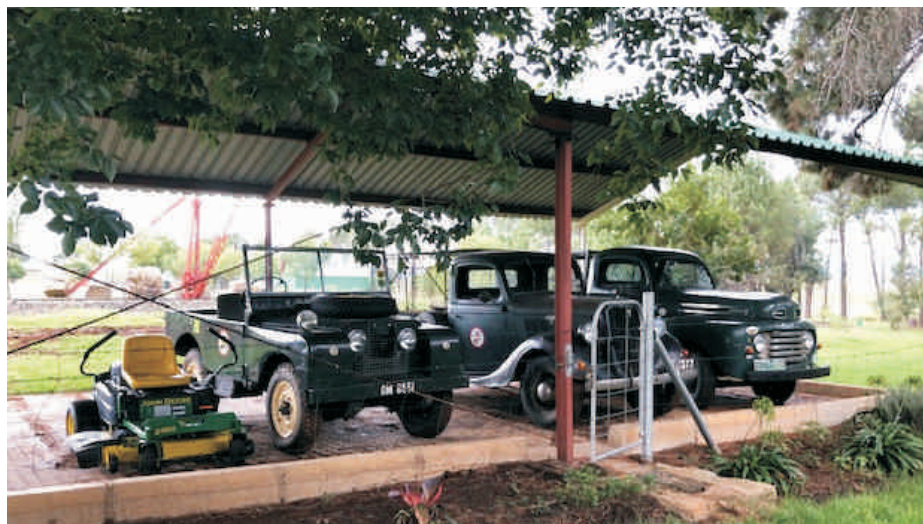
Sandstone's Series One