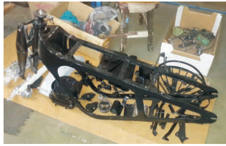
1938 Coventry Eagle