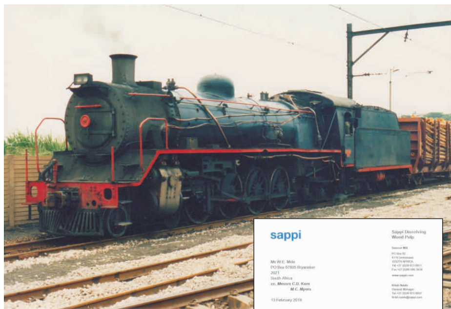
19D Sappi No 2 rests in the exchange sidings at Umkomaas before hauling a load of timber to the Saaicor Mill.