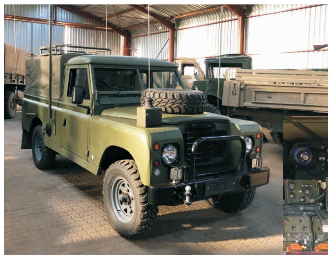
Series III Land Rover