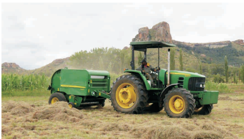
"He ain't heavy, he's my boulder!"